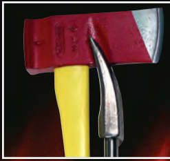
Built-In Halligan Groove