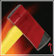
Concentrated Cutting Force