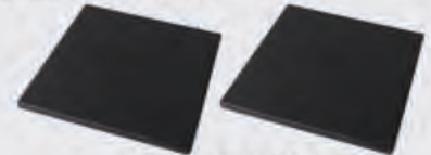
2 - Non Slip Neoprene Pad 22-890015