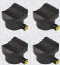
4 - Contour Base 22-796270