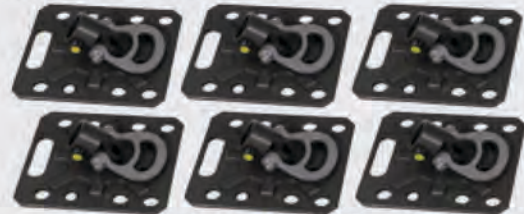
6 - Hinged Base with Anchor Ring 12 in / 30 cm 22-796180C