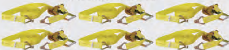
6 - Ratchet Belt with Finger Hook 27 ft / 8.2 m 22-890553