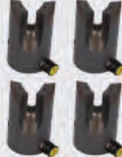
4 - Multi-Base 22-796025