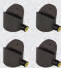
4 - V Base 22-796090