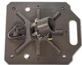
Hinged Base Plate with Anchor Ring