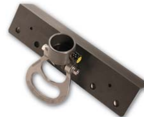
Monopod/Pulley Angle Base Assembly