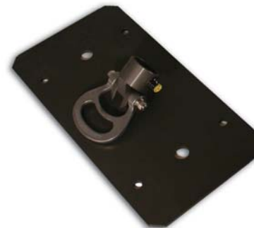
Monopod/Pulley Roof Plate Assembly