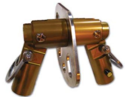
Bipod Head Assembly

The Bipod Conversion Kit is designed for use in various lifting and moving applications. It can be utilized in High Angle, Cliff Overhangs, Grain Elevator Rescue, Confined Space, Trench, Mine and Open Pit Rescues. The kit includes a Bipod Head and two Hinged Base Plates with Anchor Rings and is designed to complement the Paratech Rescue Strut System.