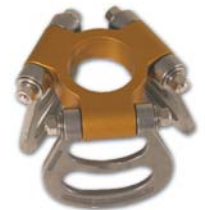
Tri Anchor Assembly

This equipment is intended for use by competent personnel specifically trained on the proper and safe use of rope rescue equipment. The Monopod Head & Pulley attach to the 610 Longshore Strut and can be used in applications such as High Angle, Elevator Shaft, Confined Space and Trench Rescue. The kit includes the Monopod Head & Pulley, Tri-Anchor Ring, Angle Base, Roof Plate and completed with a black ballistic nylon carrying case.