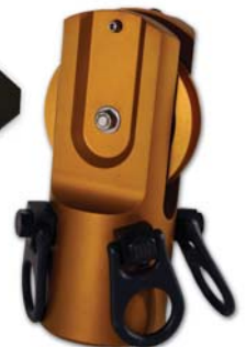
Monopod Head/Pulley Assembly